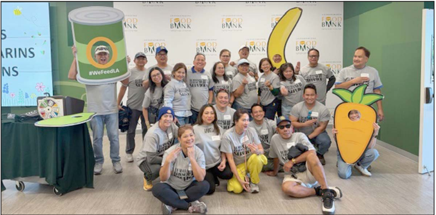
APOGLA volunteers pose for the camera following another successful and gratifying service last April 18, 2026 at the Los Angeles Regional Food Bank in City of Industry, CA.