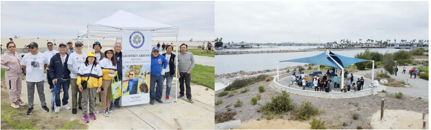
Left photo: APOGLA volunteers getting ready to do the beach cleanup of the Seal Beach bay Right photo: Aerial shot of the nearby adjacent park overlooking the San Gabriel River and Alamitos Bay Marina and site of the APOGLA September General Membership Meeting.

Vol 44 Issue 9 OFFICIAL PUBLICATION OF THE ALPHA PHI OMEGA GREATER LOS ANGELES ALUMNI ASSOCIATION October 2024