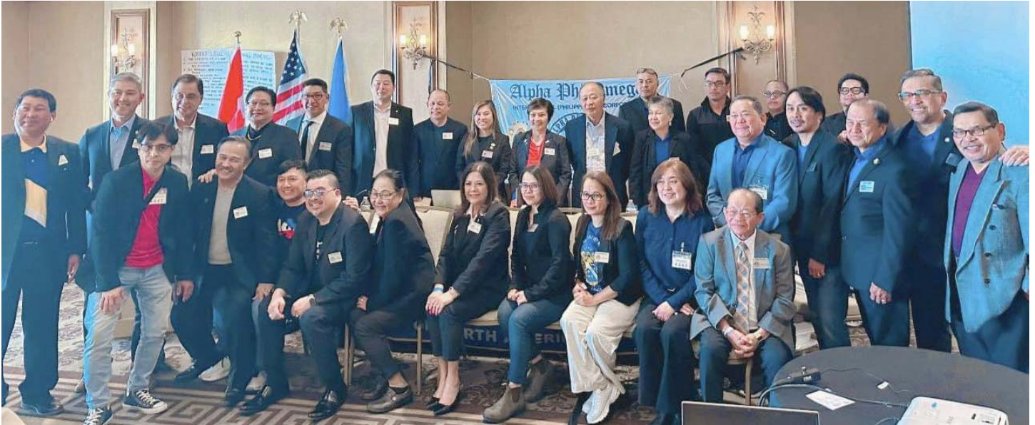
Group picture of delegates to the APO ACNA Spring Meeting 2024 hosted by APO Las Vegas at Suncoast Hotel and Casino last April 5-7, 2024.