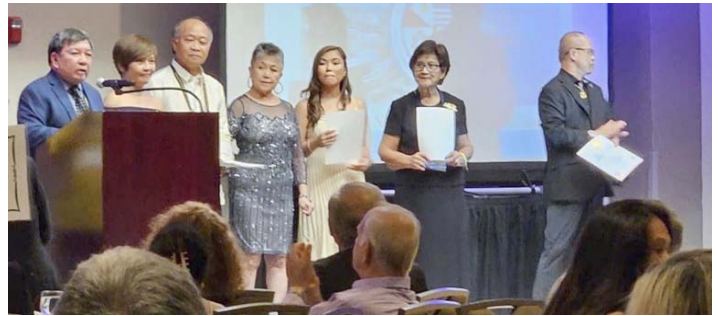
Induction of new APO ACNA Executive Officers for 2024-2025

See you the next ACNA Convention in Hawaii in 2025.