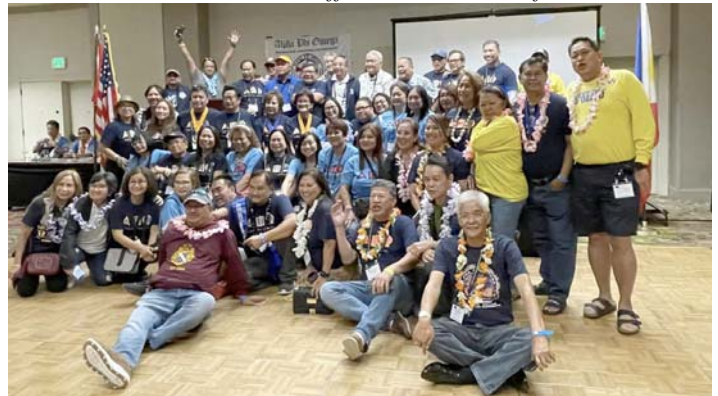
APO Greater Los Angeles Delegation