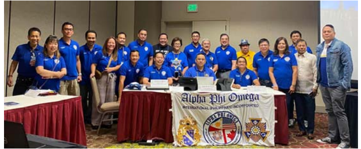
APO ACNA Executive Officers and Board of Directors