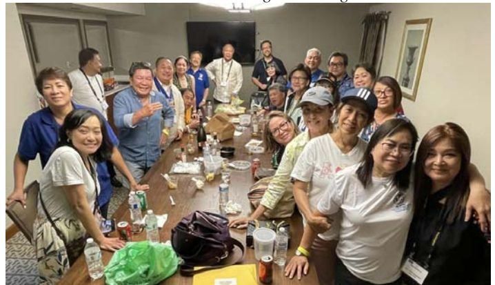
At the APO Greater Los Angeles Hospitality Suite