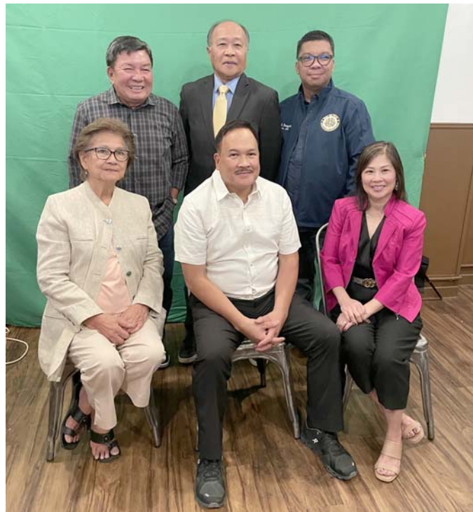
A group pose of the incoming elected Executive Officers and Board of Directors of APO Greater Los Angeles Alumni Assn.