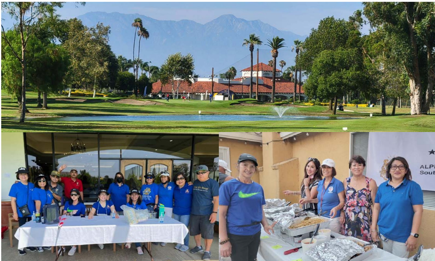
Top: Los Serranos GC in Chino, CA venue of recent Golf tournament. Bottom: APOGLA Golf Tournament volunteers