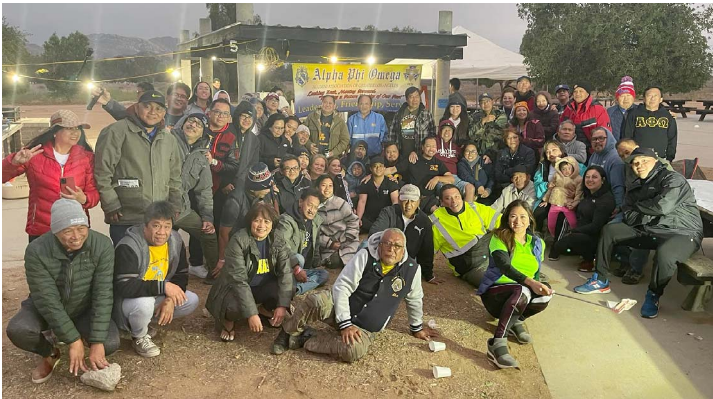
Second night group picture of campers at APOGLA's Annual Camping 2022 in Lake Perris, Moreno Valley, California